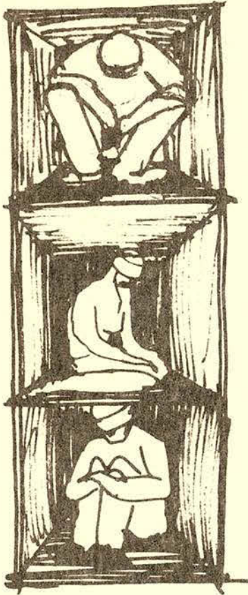
VILLA GRIMALDI : LAS TORRES